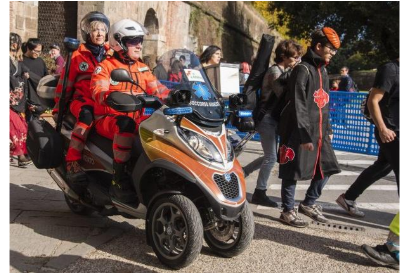
Moto ambulance with driver and rescuer in pedestrian area