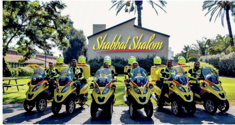
ISRAEL MDA (Piaggio MP3 500cc)