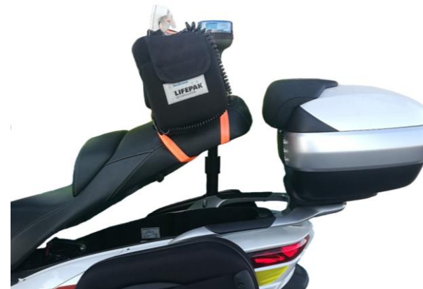
Lifepak easily fixable to rear seat