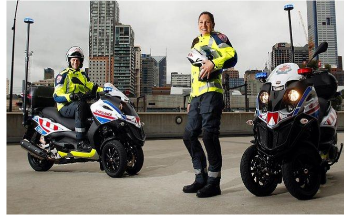
AUSTRALI-MELBOURNE FIRST AID (Piaggio MP3 500cc)