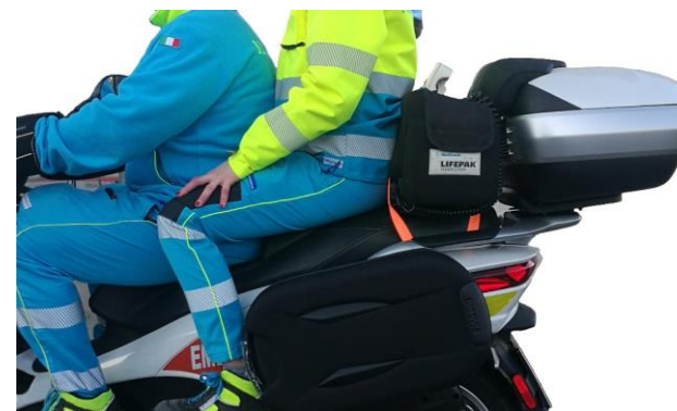
The installation of the Lifepack still allows the presence of the driver and passenger on board