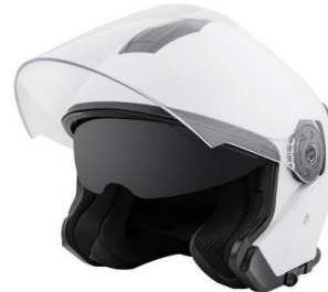
PFJ Jet Helmet