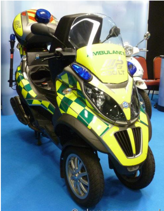
UK EMERGENCY SERVICE (Piaggio MP3 300cc)