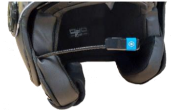
Bluetooth communication system