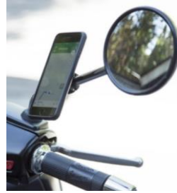
Smartphone support kit